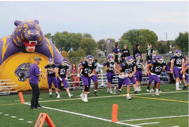
The Homecoming football game was rescheduled due to rain and lightning. The Wildcats clinched a 35-7 win over Mankato East.