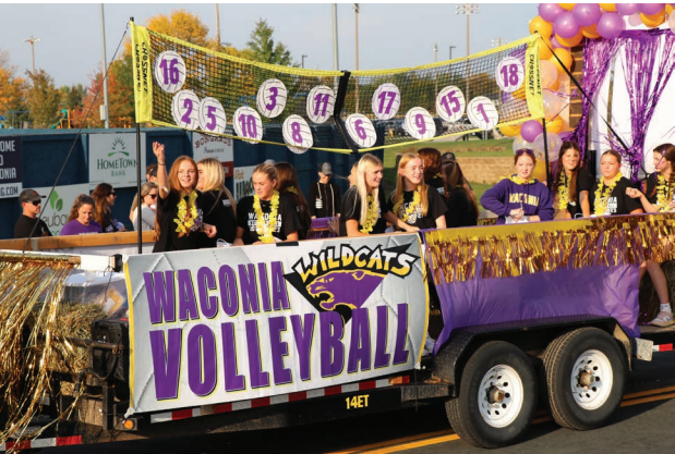
Students of various teams and clubs joined the Homecoming Parade on Community Drive.