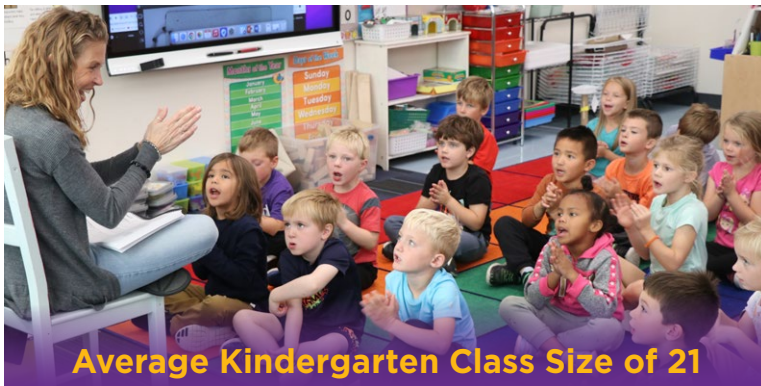
Average Kindergarten Class Size of 21