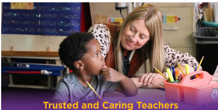
Trusted and Caring Teachers