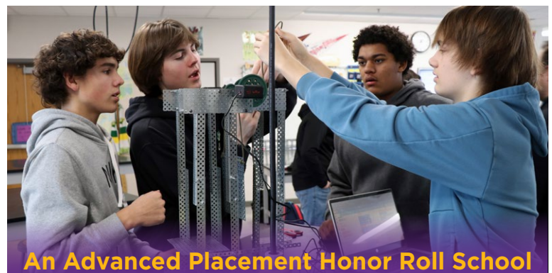
An Advanced Placement Honor Roll School