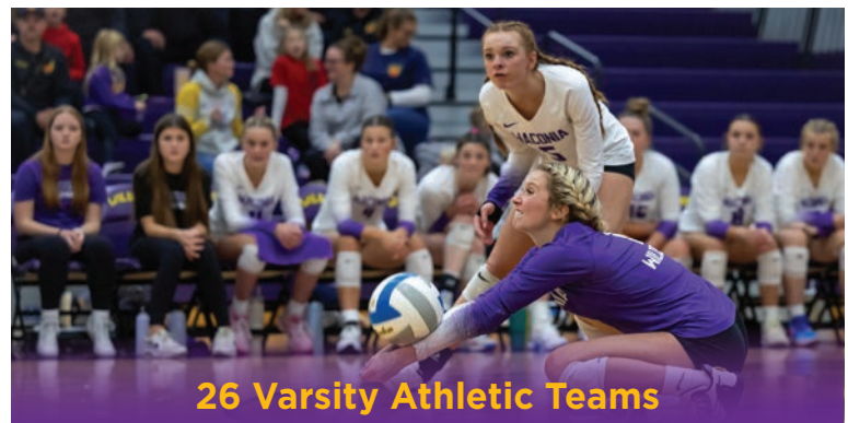
26 Varsity Athletic Teams