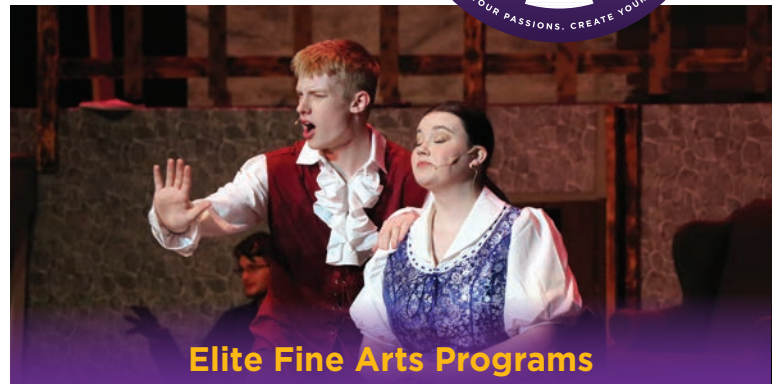
Elite Fine Arts Programs