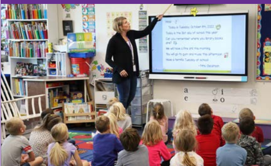
PROTECTING CLASS SIZES