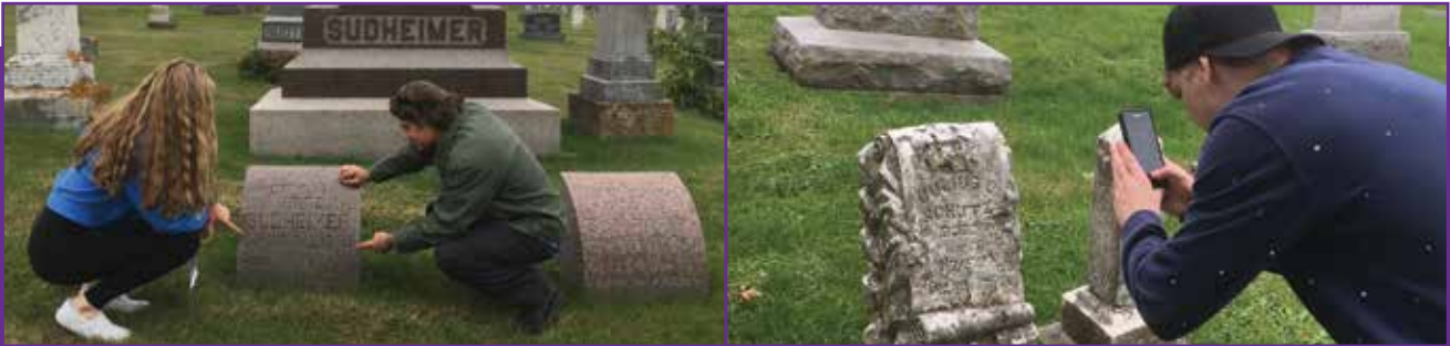
Waconia High Schools students along with their Minnesota Culture and Heritage teacher, Clark Machtemes, visit local cemeteries to learn about area history.

Most recently, the students visited cemeteries to understand where the community has been, and where it is presently. Students respectfully discover the history and research artifacts and documents left behind.