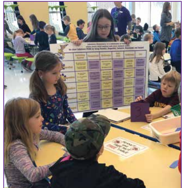
PRIDE refresher session led by 5th grade students.

Laketown's fifth-grade ambassadors are a sustaining example of PBIS, as they regularly meet to provide student input that guides and enriches Laketown's PRIDE culture. Now in its third year, PRIDE has become standard work done by all at Laketown.