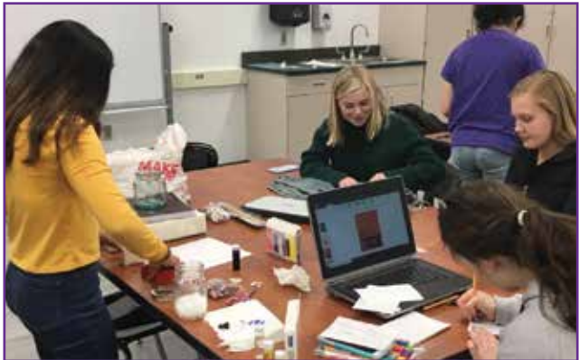
Creating an ancestry cookbook, making candles and "upcycling" clothing by distressing and embroidering jeans.

A successful clothing drive yielded many items for local thrift store Trending Upward. Some of the clothing was repurposed for individuals of different sizes and will be donated to a women's shelter. Club members also volunteered in small businesses during Waconia Chamber of Commerce's D.E.A.R. day to gain boutique shopping event experience.