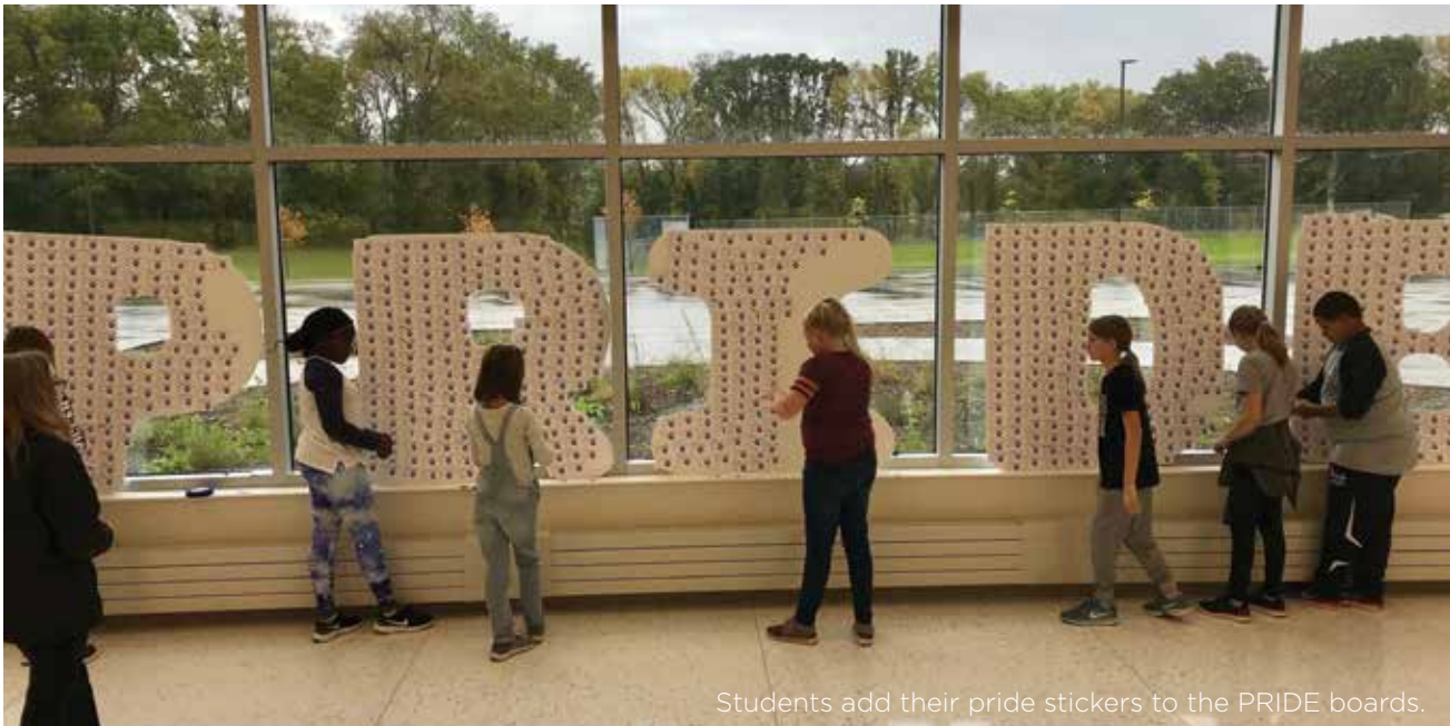
Students add their pride stickers to the PRIDE boards.

At Laketown Elementary, achieving 2018 PBIS Sustaining Exemplar School status represents both a milestone achievement and a defining benchmark for students and staff. The Positive Behavioral Interventions and Supports (PBIS) framework, known as PRIDE, promotes common understanding, common language, and common practices around behavior expectations across the school setting. Being Peaceful, Respectful, Inclusive, Determined and Engaged defines what behavior should look like, sound like, and feel like, whether you are a student, a teacher, school secretary or cook.