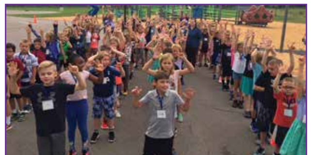
Laketown students showing their PRIDE after recess.

"As a school administrator, I appreciate that PBIS is very much in line with a teaching mindset," Wittman said. "It's preventive and proactive. It brings around hope and growth more over something that feels like despair or I'm always in trouble. Yes, there are consequences for major infractions, but it's all in the eye of helping them to learn and grow and be successful. It's not a gotcha system. We want to be a place for kids to learn."