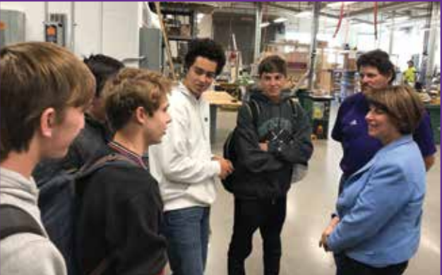
Sen. Amy Klobuchar talking to a group of Project Lead the Way students about their experience.

U.S. Senator Amy Klobuchar received a firsthand look at the opportunities being created for students during a tour of Waconia High School in late October. “The programs and classes we saw today are all about creating opportunities for students and meeting employer and workforce needs. And it’s a model we should be embracing on a broader scale to ensure we are preparing young people for the jobs of tomorrow that our businesses are creating today,” Klobuchar said during her visit.