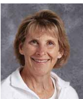
Kathleen Schultz Educational Services Center Laketown Elementary 13 years in ONE10