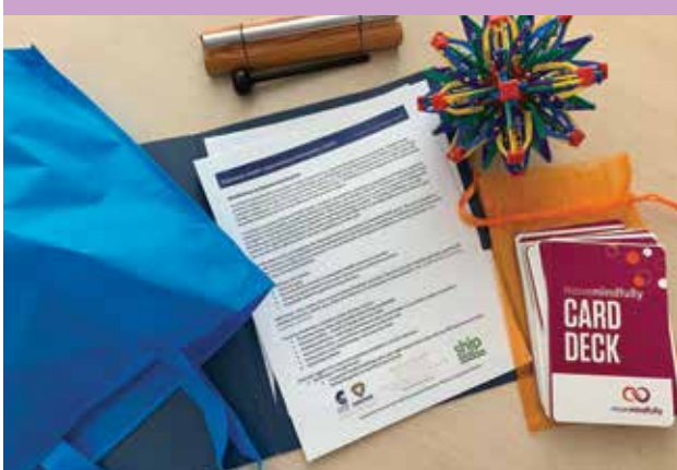
Mindful kits help kids manage big emotions in healthy ways

Through a Statewide Health Improvement Partnership (SHIP) grant award, elementary schools have new mindfulness kits for teachers, educational assistant rooms, special education, and specialists. Along with the peaceful packs and peaceful places already in classrooms, these kits expand the ways that teachers and staff help kids manage big emotions in healthy ways. Carver County Public Health is also partnering with our schools to offer mini mindfulness training sessions for staff.