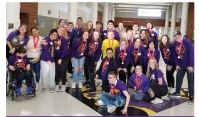
2019: Waconia High School Unified Bowling