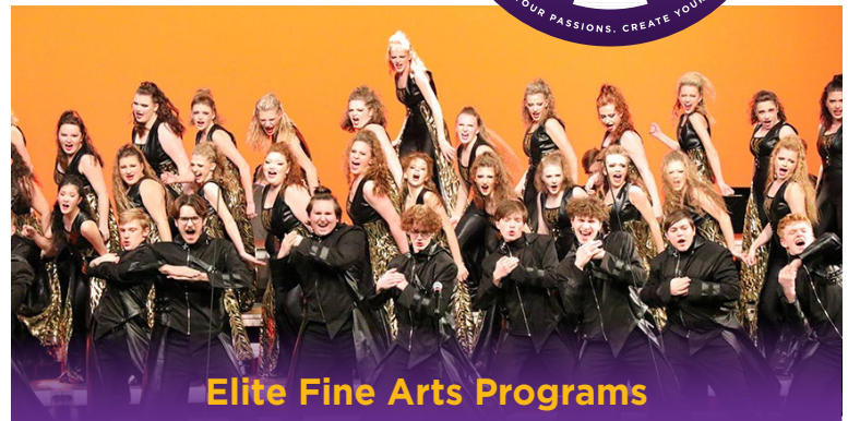
Elite Fine Arts Programs