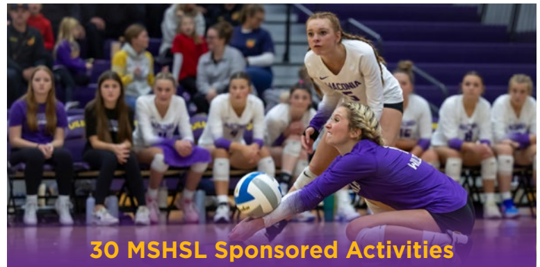
30 MSHSL Sponsored Activities