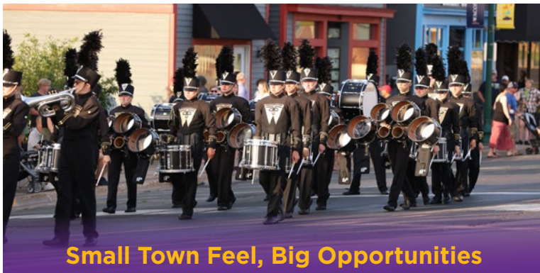
Small Town Feel, Big Opportunities