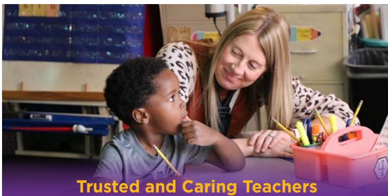
Trusted and Caring Teachers