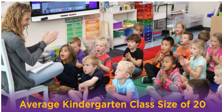
Average Kindergarten Class Size of 20