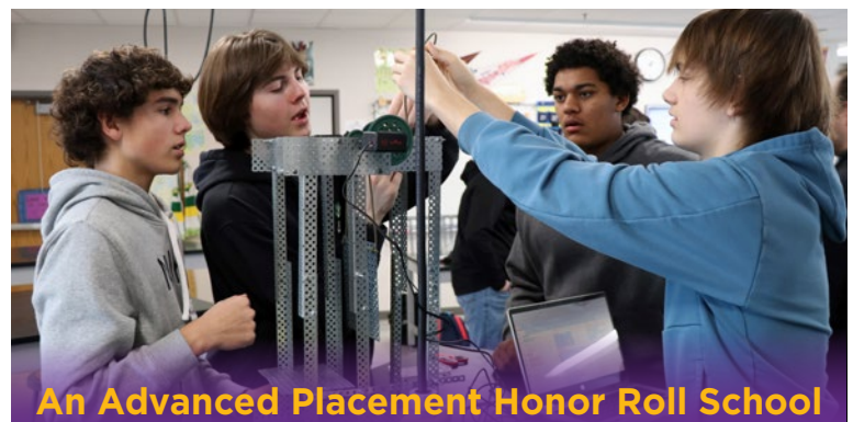
An Advanced Placement Honor Roll School