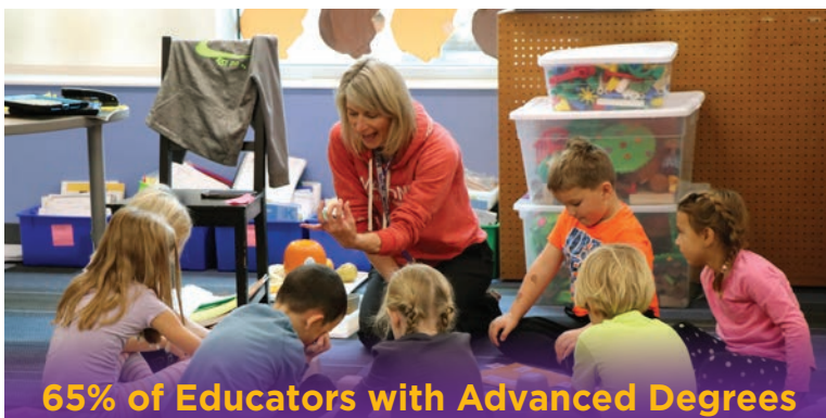
65% of Educators with Advanced Degrees