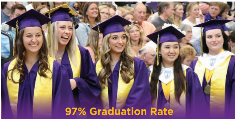
97% Graduation Rate