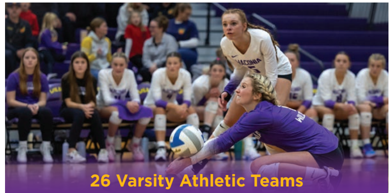
26 Varsity Athletic Teams