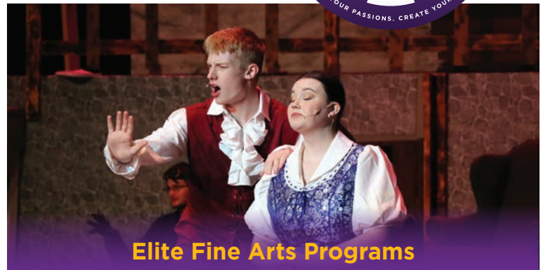
Elite Fine Arts Programs