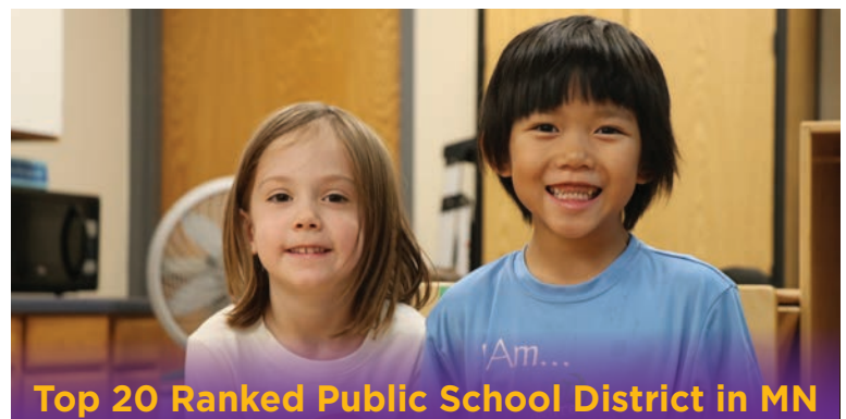
Top 20 Ranked Public School District in MN